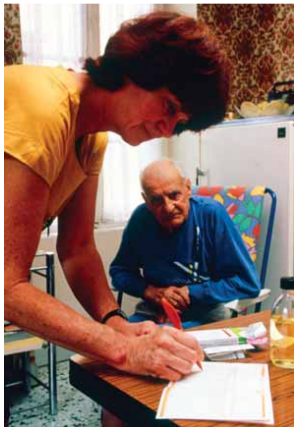
Fig 3. GP on a visit. During visits doctors get to see first hand the social and physical environment of their patients.

Using consultations to address wider social issues could reap benefits for the long-term care of the patient, and also prompt them to act as expert patients and advocate for health issues with their family, friends, colleagues and the wider communities in which they live.