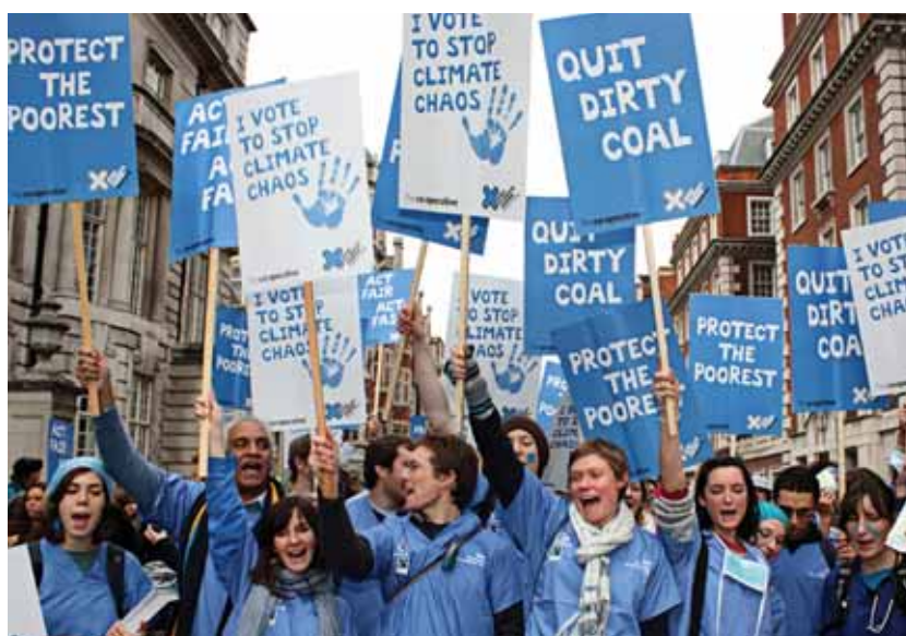
Fig 5. Medical students can be powerful advocates for change.

There is also a need to have more flexibility in the professional development of clinical specialists. This could come from encouraging trainees to take accredited public health modules as part of clinical specialty training or undertaking dual accreditation (a combined public health